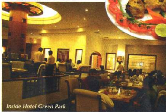
Inside Hotel Green Park

Alwarthirunagar : 45550075 | Kilpauk : 42660980 info@inshape.in / mail2inshape@gmail.com